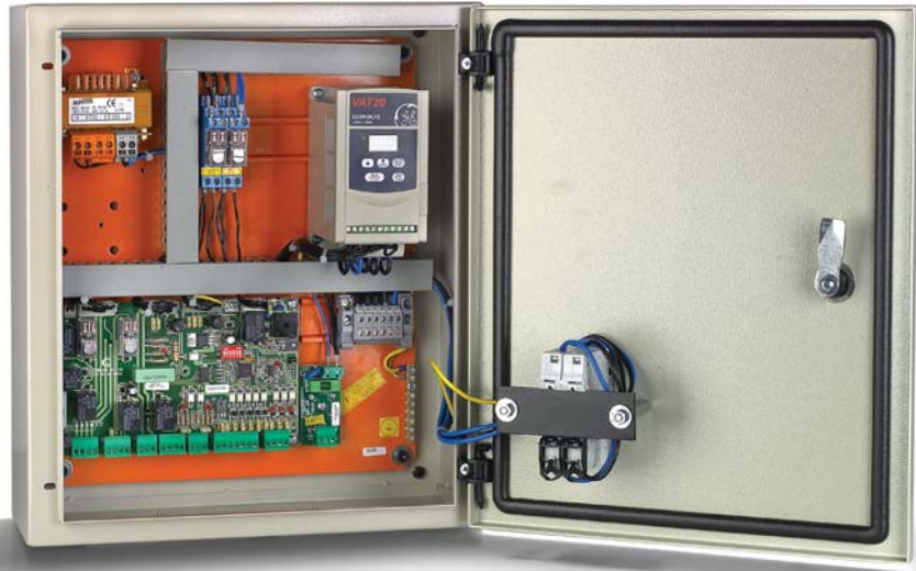
Cargo VVVF. Platform controller

Adapted for control the most platforms types and lifts for diseased people, the KDT system is based on a conventional concept but incorporates modern electronics to cope with EMC/EMI rules, covering market requirements up to 8 stops.